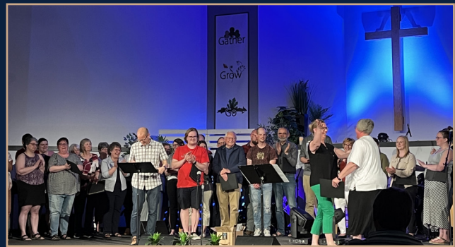
Celebrating a local church FS graduation. 60+ grads their first year.

We do our best to operate frugally with modest salaries and minimal overhead. We sense God asking us to take some large faith steps forward to expand in ways far beyond what we initially imagined. We know you believe in Freedom Session. We humbly invite you to partner with us or continue your partnership in this important ministry.