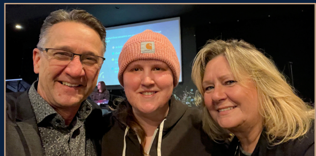
Meeting a FS grad from a recovery home.